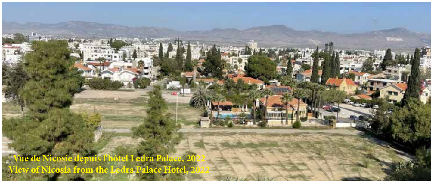
Vue de Nicosie depuis l'hôtel Ledra Palace, 2022 View of Nicosia from the Ledra Palace Hotel, 2022

Any air carrier providing transportation in connection with these tours is not to be held responsible for any act, omission or event during the time the passenger is not on board its planes. The passenger contract in use by the airlines concerned, when issued, shall constitute the sole contract between the airline and the purchase of these tours and/or passenger. Similar responsibility as noted applies to all types of carriers, including car rental companies.