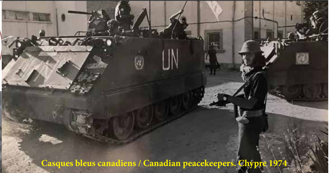
Casques bleus canadiens / Canadian peacekeepers. Chypre 1974