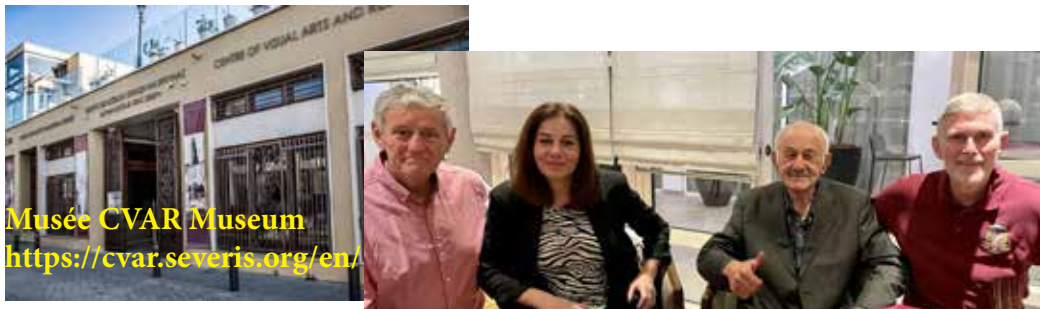
Musée CVAR Museum https://cvar.severis.org/en/

On November 11th , the Canadian Remembrance Ceremony will be held at the Peacekeeper Memorial in Wolseley Barracks UN Sector 2 HQ. We will dedicate a Cyprus 2024 plaque commemorating the 60th anniversary of Canada's contribution to the UN Force in Cyprus. Veteran Affairs will lead the service, with Canadian Armed Forces soldiers mounting the guard, sentries and providing music. A reception will follow at the Ledra Palace Sector 2 Officers' Mess for veterans, families and soldiers to be together in the Canadian tradition of Remembrance Day.