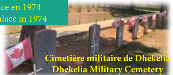
Cimetière militaire de Dhekelia Dhekelia Military Cemetery