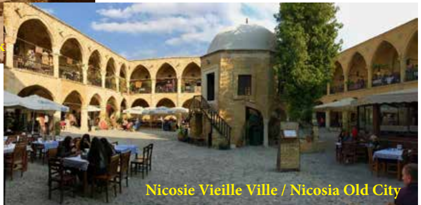
Nicosie Vieille Ville / Nicosia Old City