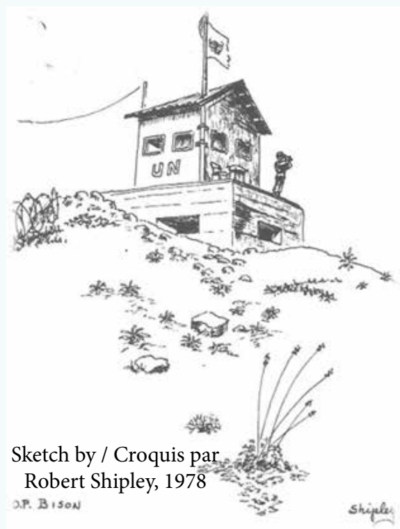
Sketch by / Croquis par Robert Shipley, 1978