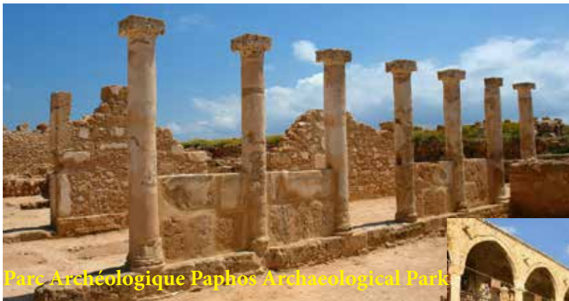
Parc Archéologique Paphos Archaeological Park

Located in the Larnaca region, the mountainous village of Lefkara is world-renowned for its traditional handicrafts of lace embroidery and filigree silver. The village is situated at the foot of the Troodos Mountains in the south eastern region, 650 meters above sea level. The crafts of lace and silver have been practiced in the village since Venetian times, and visitors can learn all about them, and watch the lace and silver being made at the various workshops within the village. Legend has it that the famous painter, Leonardo da Vinci himself visited the village in 1481 and bought a lace altar cloth, which he donated to Milan cathedral. The character of the village is very picturesque with its narrow, winding streets and traditional architecture of old, terracotta-roofed houses.