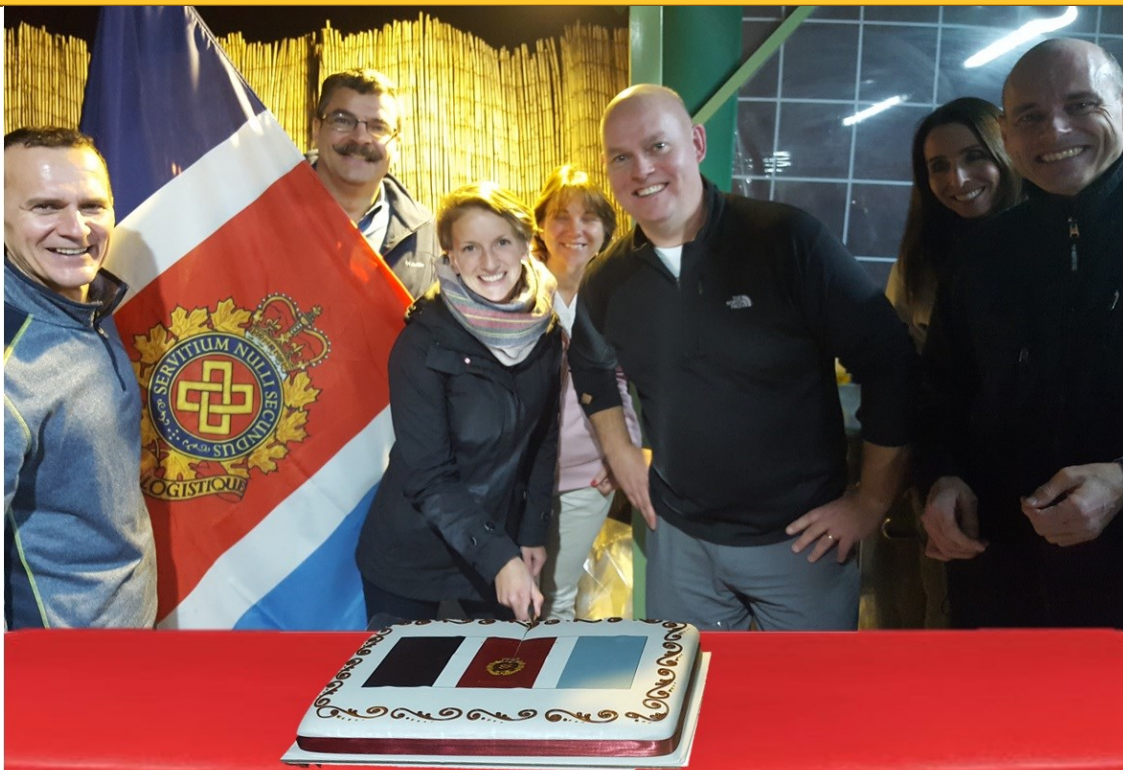
Staff of TF Jerusalem and Honored Guests from CJOC celebrate the Logistics Branch Anniversary with the cutting of the cake.