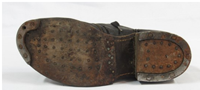
View of the shoed sole and heel.

Impressively, the boots are triple soled with a half sole thrown in for good measure. One weighs 1080 grams which is almost 100 grams more than the old Mk III boot of which many of you are familiar.