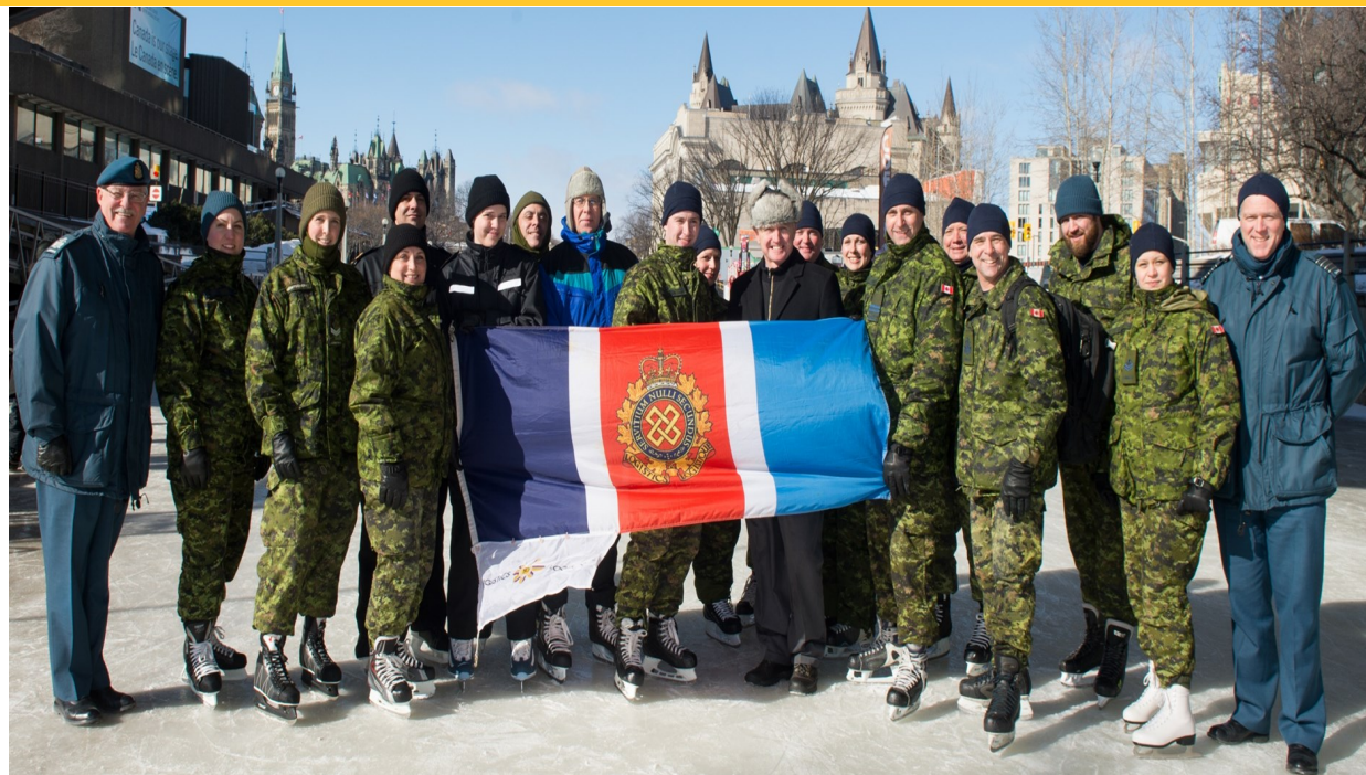
The Logistics Branch Flag on the largest naturally frozen skating rink in the world, the Rideau Canal Skateway.