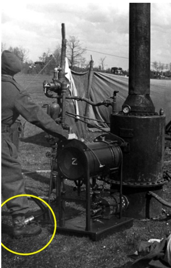
Boot worn by a Logistician operating a water heater for showers, Germany, April 1945.

Impressively, the boots are triple soled with a half sole thrown in for good measure. One weighs 1080 grams which is almost 100 grams more than the old Mk III boot of which many of you are familiar.