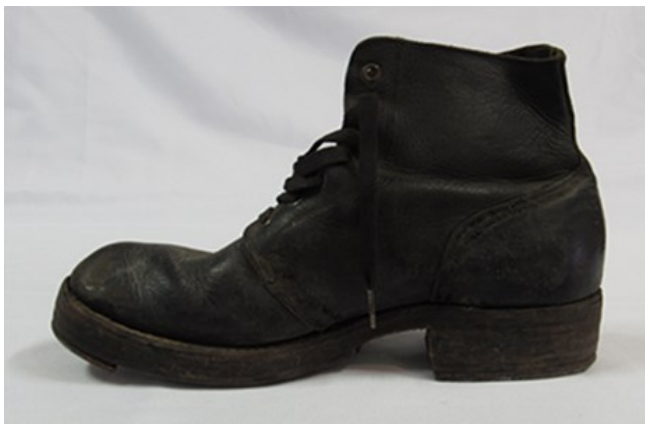
The ankle boot

The boot, also known as the ‘ammo boot’ or the ‘ankleboot’ traces its roots to the 1880s. The ankle high boot provided significant ankle support, much like a skate. It had a pebbled surface. The soldiers worked the toe of their boots with a very warm spoon to rub out the dimples. Canadian boots in the First and Second World Wars did not have a toe cap, unlike their British counterparts. Our example has, as expected, both heel and toe plates, and at one time had hobnails.