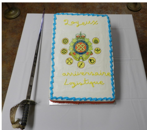
The cake prepared by the staff of the 34th Service Battalion

inviting all logisticians from three units of the Reserve Montreal area. The 34th Service Battalion, 438 Helicopter Squadron, and the HMCS Donnacona Naval Reserve, celebrated with coffee and cake. Forty logisticians took the time to celebrate and discuss the realities of each of their organizations.