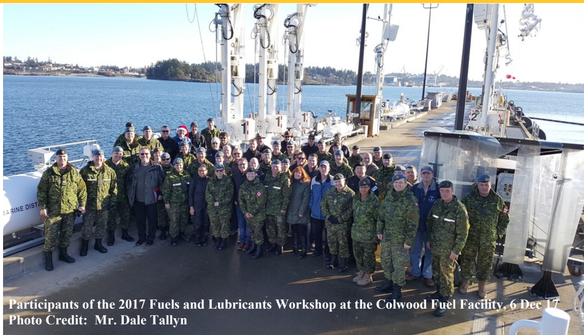
Participants of the 2017 Fuels and Lubricants Workshop at the Colwood Fuel Facility, 6 Dec 17

Initial feedback from the workshop participants has been very encouraging. SJS J4 F&L will be establishing a SharePoint site in the near future in order to further the discussions that transpired. Overall, the workshop was a huge success and we look forward to improving fuel operations and inviting members of the F&L community to come together again in late 2018.