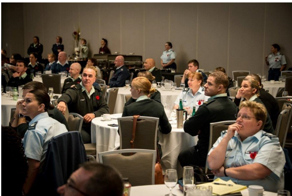
Just some of the 150 + HRA’s who were in attendance at the Trg Sessions 31 Oct—02 Nov 17 at the Infinity Convention Centre.

When asked why training like this is so important and what impact the training