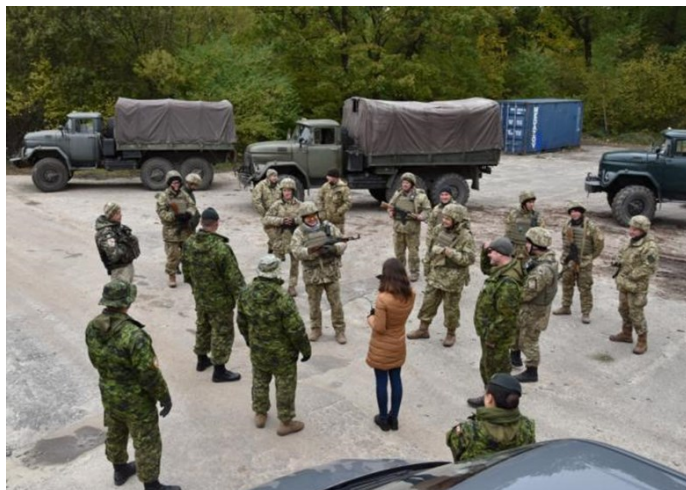
Candidates gather to conduct a debriefing with staff during the Train the Trainer course's convoy operations portion.