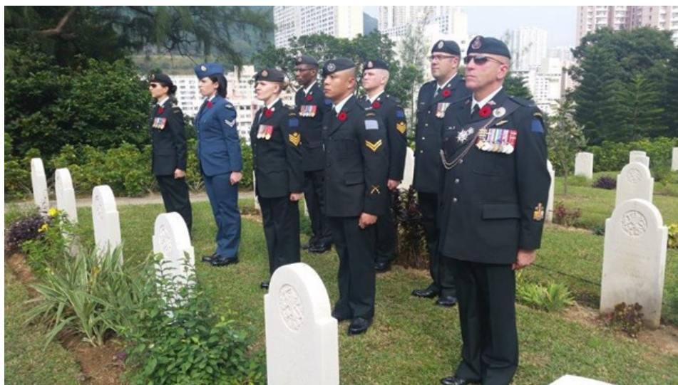
The CAF Honour Guard