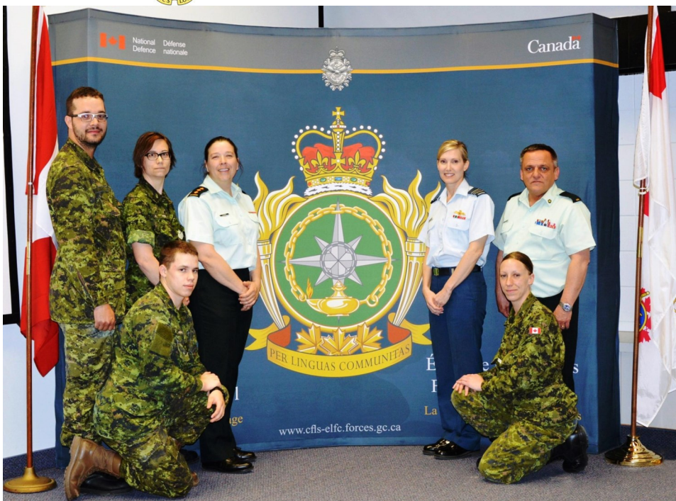
Logisticians from CFLS HQ and the National Capital Region Training Company (NCR Trg Coy) in spring 2016.

I also quickly noticed how many choice positions the CFLS had to offer personnel from the Logistics Branch. Whether it was command positions for officers (DCmdt of the school, OC of Det Saint-Jean and 2IC of Det Saint-Jean) or other NCM positions (administration officer/chief clerk, orderly room supervisor, clerk, Canadian Division coordinator, supply section supervisor and supply