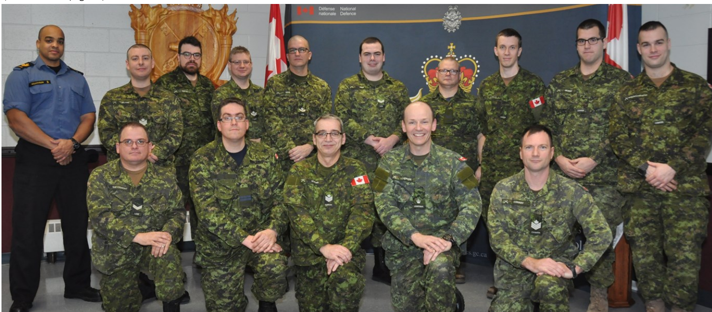
Logisticians from CFLS Det Saint-Jean (permanent military personnel and students) on 1 February 2016 during the Logistics Branch's 49th Anniversary celebrations