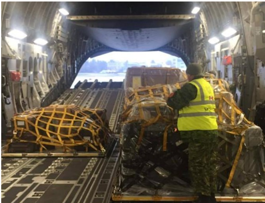
An Op UNIFIER Traffic Technician inspects outgoing freight on the mission's mid-November dedicated Service Flight